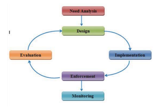
Figure 2. Governance Cycle based on KepemenPAN-RB/2011

The governance conceptually has two different dimensions, which are autonomy and capacity. Capacity and autonomy exclusively composed of resources and the degree of professionalism of the organizers of the bureaucracy, which is further away, these two things can then determine the quality of the management of which should ideally be independent. However, in reality the governance still become a difficult thing to define because it is associated with many complex things (Fukuyama 2013: 16). Meanwhile, according to Kemenpan/ RB (Ministry of Administrative Reform), the bureaucratic reform should meet the following principles: definitive, which the governance should have the boundaries, clear inputs and outputs. Sequence, in which the governance must consist of activities that in sequence accordang to space and time. Customers, where the governance should have a result. Value-added, which the governance should give the value-added to the receiver. Linkage, which the governance should be involved in the structure of an organization, and function of the cross, which the governance should include the multiple functions at once (KepmenPAN / RB No.12 2011). These principles constitute the ideal value of a governance process in a management sycle cycle as follows: