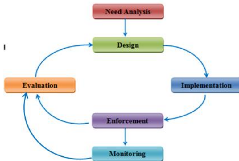
Figure 2. Governance Cycle based on KepemenPAN-RB/2011

However, in reality the governance still become a difficult thing to define because it is associated with many complex things (Fukuyama 2013, p. 16). Meanwhile, according to Kemenpan/ RB (Ministry of Administrative Reform), the bureaucratic reform should meet the following principles: definitive, which the governance should have the boundaries, clear inputs and outputs. Sequence, in which the governance must consist of activities that in sequence accordang to space and time. Customers, where the governance should have a result. Value-added, which the governance should give the value-added to the receiver. Linkage, which the governance should be involved in the structure of an organization, and function of the cross, which the governance should include the multiple functions at once (KepmenPAN / RB No.12 2011). These principles constitute the ideal value of a governance process in a management cycle as follows: