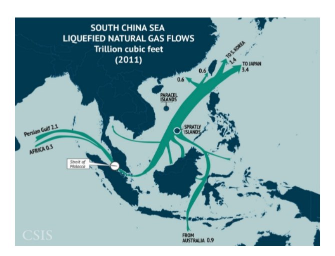
Fig 2. Routes of ships carrying liquefied gas through South China Seas