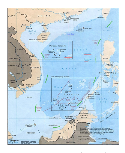
Fig 3. Map of South China Sea showing China's Nine Dash Line Claim (in green): modified version of 1988 map from U.S. Central Intelligence Agency - Asia Maps — Perry-Castañeda Map Collection: Wikimedia Commons

The desire for possession of the sea, on the one hand, and the characteristic of the sea as an open space, on the other, have resulted in countries with maritime interests consenting to agreements and international rules that regulate maritime matters but issues concerning these frequently arise, and maritime territories are often subject to disputes involving various countries. For example, Natuna became the subject of such a dispute in 2009 when China included it as part of its national territory in a map that expressed its perception of its maritime border in the South China Sea marked by nine line points, known—and subsequently referred to here—as the 'Nine Dash Line' (NDL) (Figure 3). The size of the area encompassed by the NDL is 3.5 million square kilometers, covering 90% of the whole South China Sea.