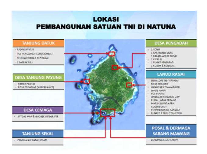
Fig 5. Location of military units in Natuna

According to Van Evera (1998), there are several factors that influence the state in policy-making relating to its defensive force - including military, geographical, socio-political and diplomatic ones. These four factors directly influence defense policy formulated by a country, and the defensive force of a country will always reflect these four factors. In Indonesia's New Order Era (1966-1998) national policies focused on developing land defense forces, neglecting the nature of the country as an agglomeration of islands and marine spaces.