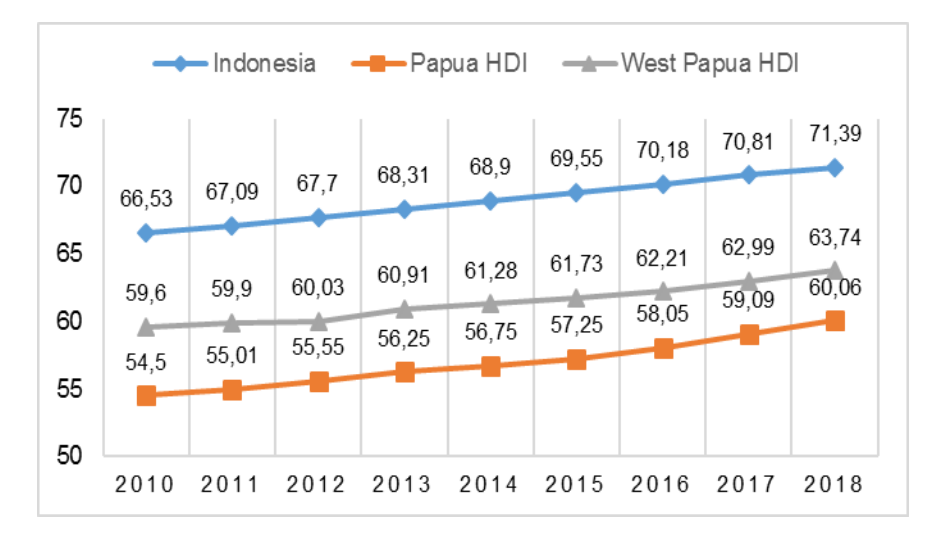
Figure 1. Comparative Human Development Index (HDI) of the National, Provincial of Papua and West Papua

The Audit of the Supreme Audit Board of the Fiscal Year 2016 shows that the Papua Public Health and Social Security programs are not synergistic so that the Provinces of Papua and West Papua lose the opportunity to use a special autonomy fund of at least Rp. 33 billion. It is because the Provincial Health Office is not careful in conducting studies and analysis related to the synergy of the implementation of the Jamkesmas and Jamkespa programs.